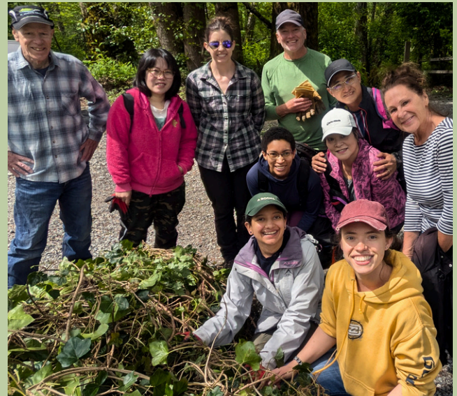
Burnaby Mountain Invasive Removal May 9, 2025

The Invasive Species Council of Metro Vancouver (ISCMV) is a non-profit society that has been working since 2006 to improve invasive species management in the Metro Vancouver region. The ISCMV provides leadership on invasive species management through programs, resources, services, and collaboration with partners.