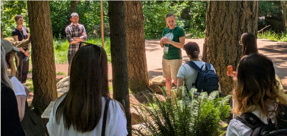
Champlain Heights Trails walk, ISCMV Spring Forum & AGM, May 18 2025