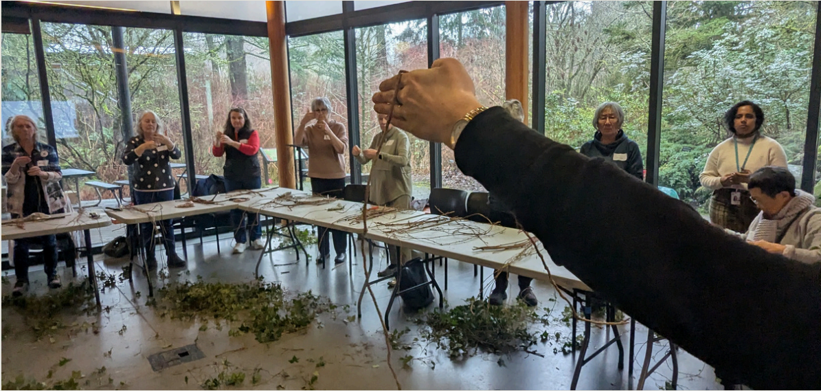
Ivy Basket Weaving at VanDusen Gardens, Jan 31, 2026