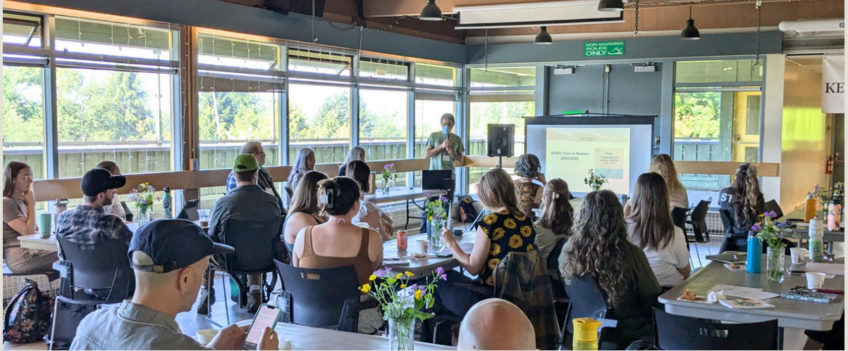
Spring Forum & AGM, May 28 2025